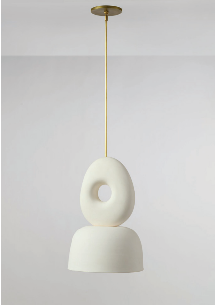
HAND SANDED FINISH